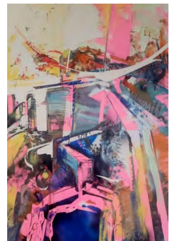
Hoover Dam 64” x 47”